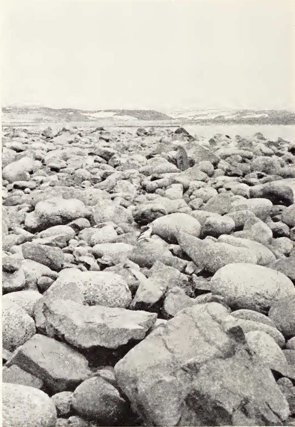
Fig. 7. Snow Bunting, a) nest site in the gravel bed of Boxer River, b) leaving through south entrance, c) clutch, 28 June 1960.

about two to three days old on 30 June. On 8 July immatures 15 to 16 days old roamed about Boxer Lake. A nest with three eggs we found in a wet meadow about 100 meters north of the camp on 20 July may have been a second clutch encouraged by the exceptionally favorable summer of 1960.